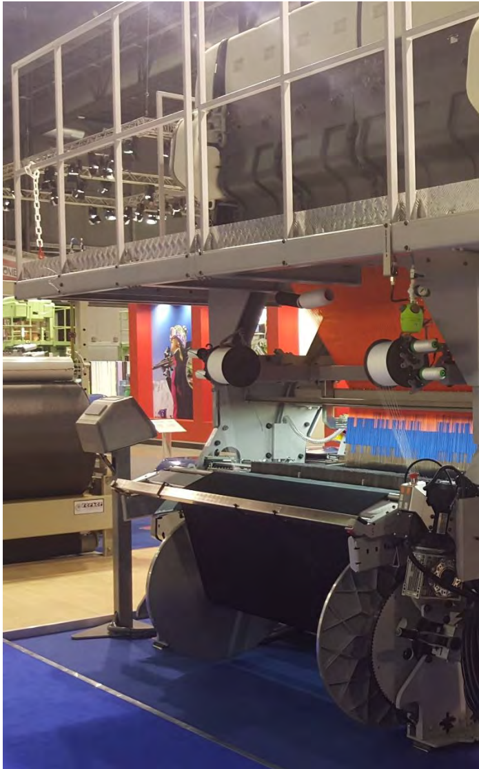
Jumbo Back rest bar High Compensation for Label production